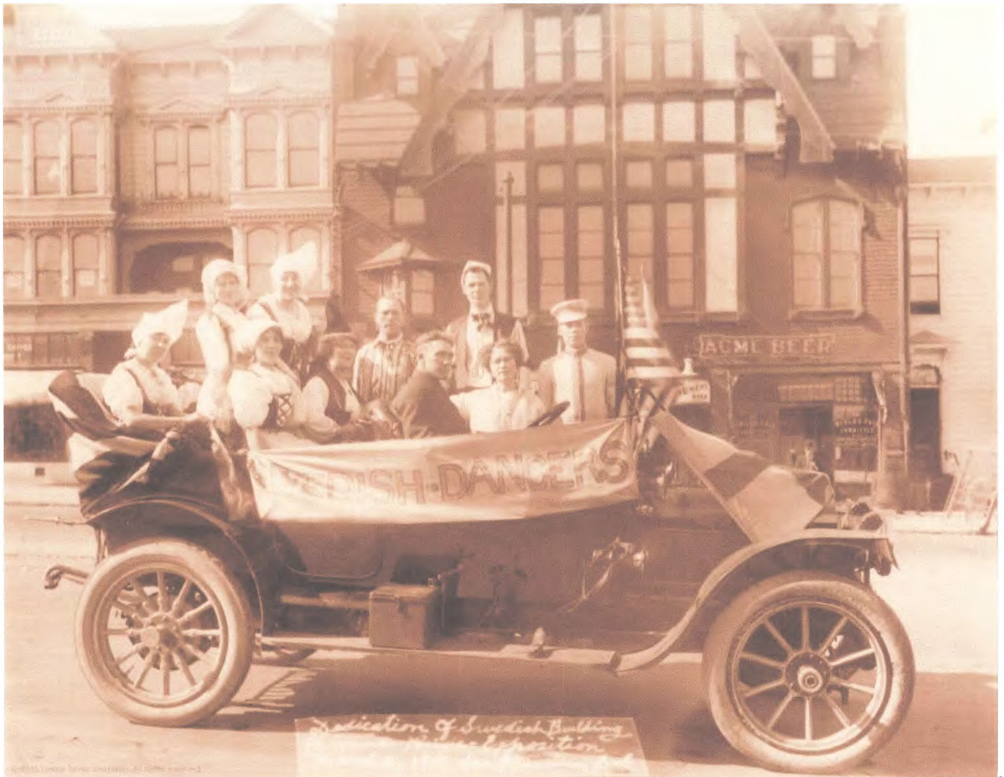
SWEDISH SOCIETY MEMBERS AT CAFE DONNO IN 1915