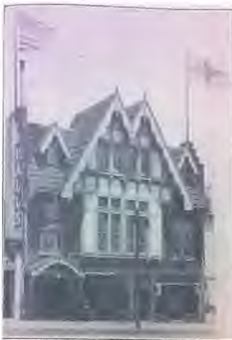
Swedish American Hall, 2174 Market Street, San Francisco. (reproduced 1907)

It's an exciting new chapter for the hall, built in 1907. The Gold Rush brought an influx of Swedes to San Francisco, who formed several fraternal groups in an effort to preserve customs and simply find people to speak their own language with. One such group was the Swedish Society of San Francisco, which started in 1873 as a choral group called the Original Orpheus Singing Club, and sang traditional Swedish songs like " Klara stjärnor " ( https://www.youtube.com/watch?v=UlvI5WvSZZY ) and " Sångarfanan " ( https://www.youtube.com/watch?v=YmIZWWjxxo ). Like many organizations of the time, they soon became more of a traditional fraternal organization, offering their members sick benefits and burial services in exchange for dues of a dollar per month.