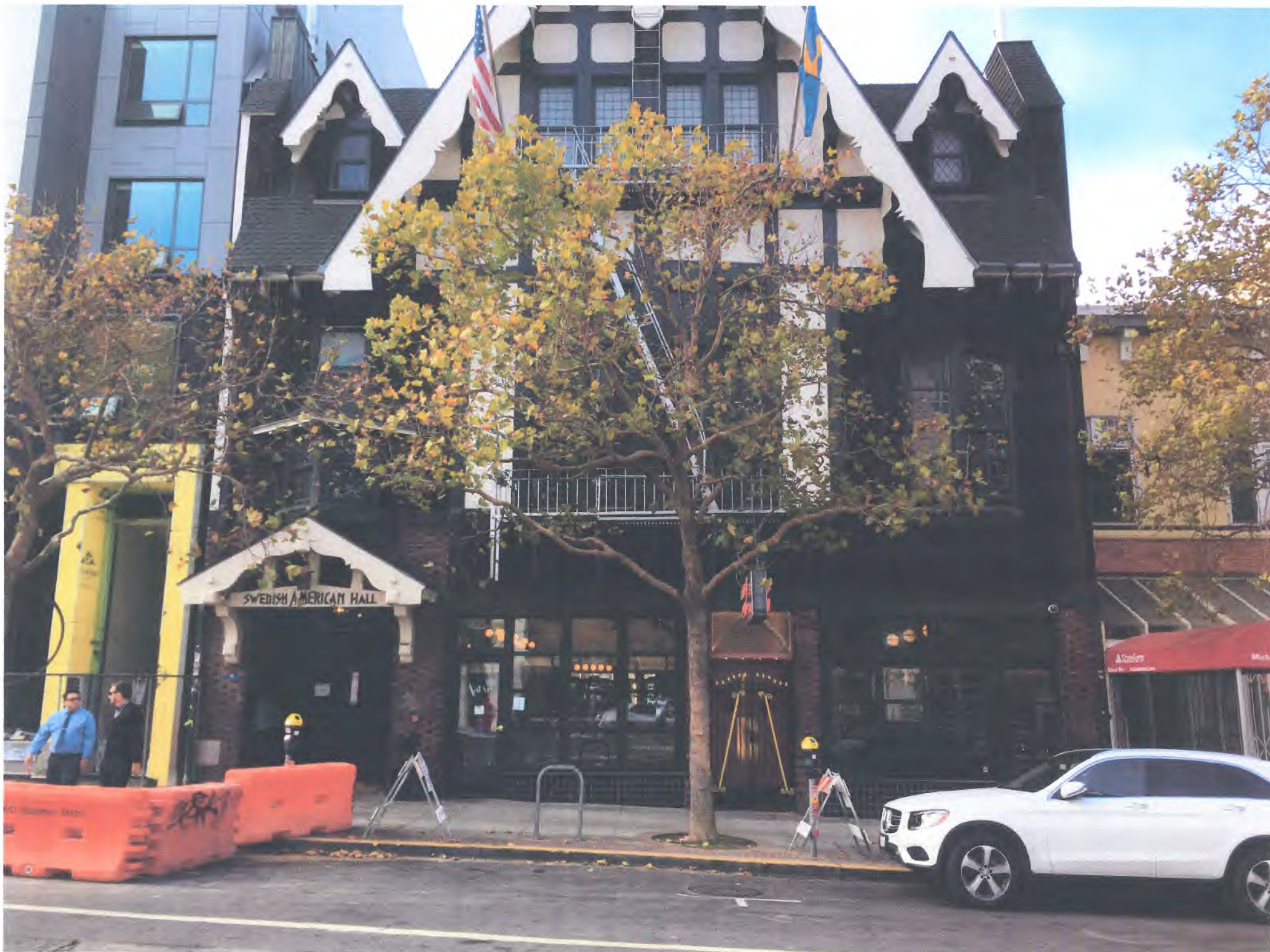
PRESENT DAY FACADE OF CSN