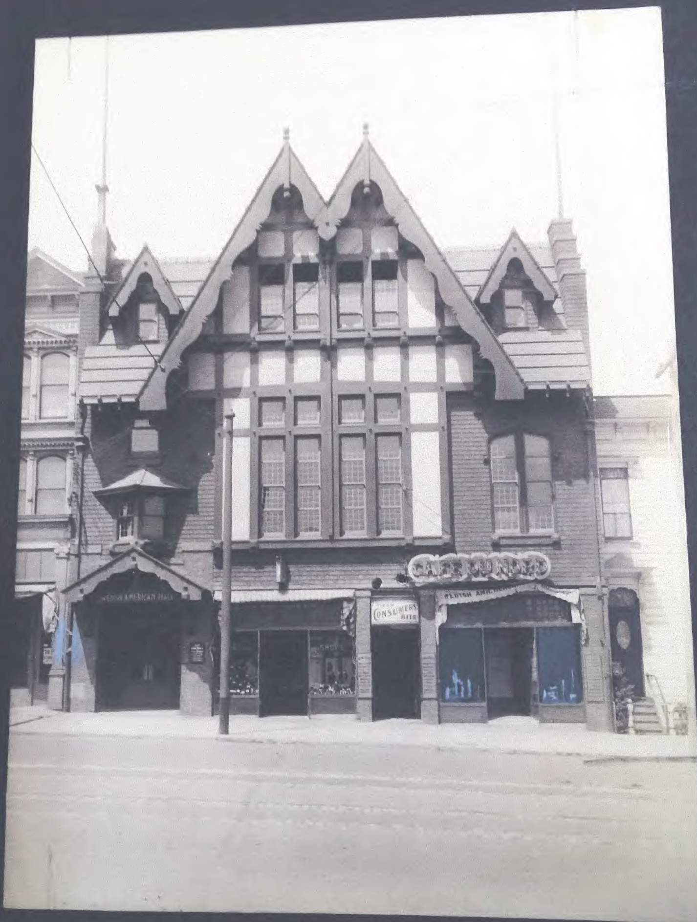
SWEDISH HALL IN 1908 WITH CAFÉ LUND