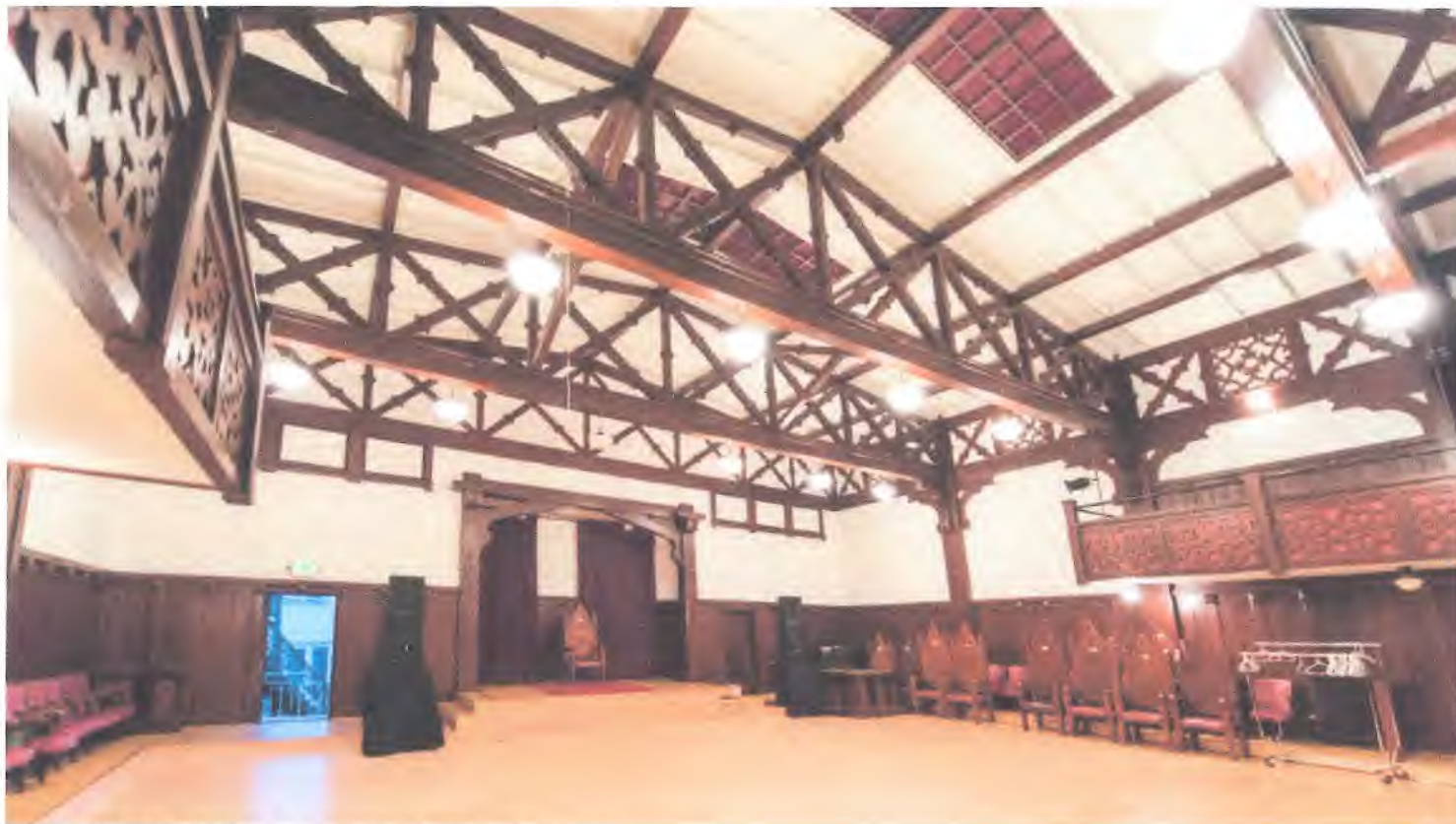
Interior of the Swedish American Hall; courtesy Swedish Society of San Francisco

By Shelby Pope (https://www.kqed.org/arts/author/spope/) ⓧ (http://twitter.com/shelbypope)