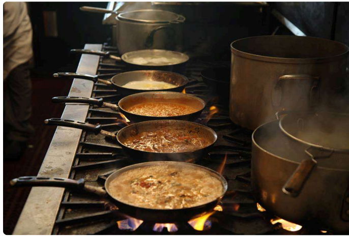
A variety of dishes on the stove.

While offering an extensive menu with "something for everybody" helps drive word-of-mouth and attract repeat customers, it's not just a marketing ploy, Dial said. "Everything I make, I want to make it like the best you've ever had. I don't want to make it just to be there ... It's really important to me to make high-quality food in very big portions at a very decent price with really crazy service."