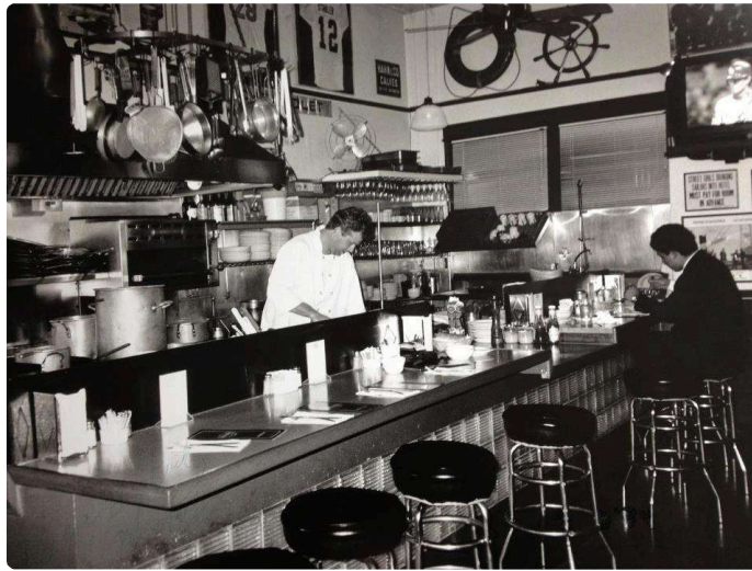
Dial in the kitchen during Rocco's early days.

While the restaurant sat in escrow for seven months, Dial spent 10 hours a day, five days a week renovating the space himself, he says. With a fully stocked kitchen, $1,300 he made from catering a film shoot and all odds against him, he opened his doors for breakfast, lunch and dinner in June 1991.