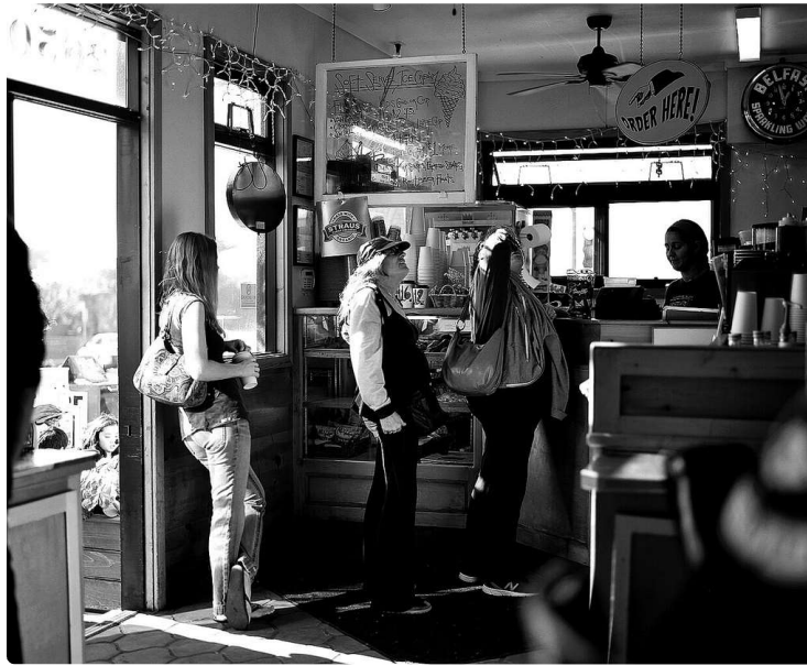
Patrons lined up for coffee.