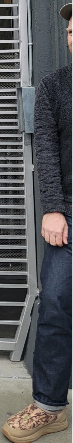
940 Howard St April 04, 2024 5:15 PM