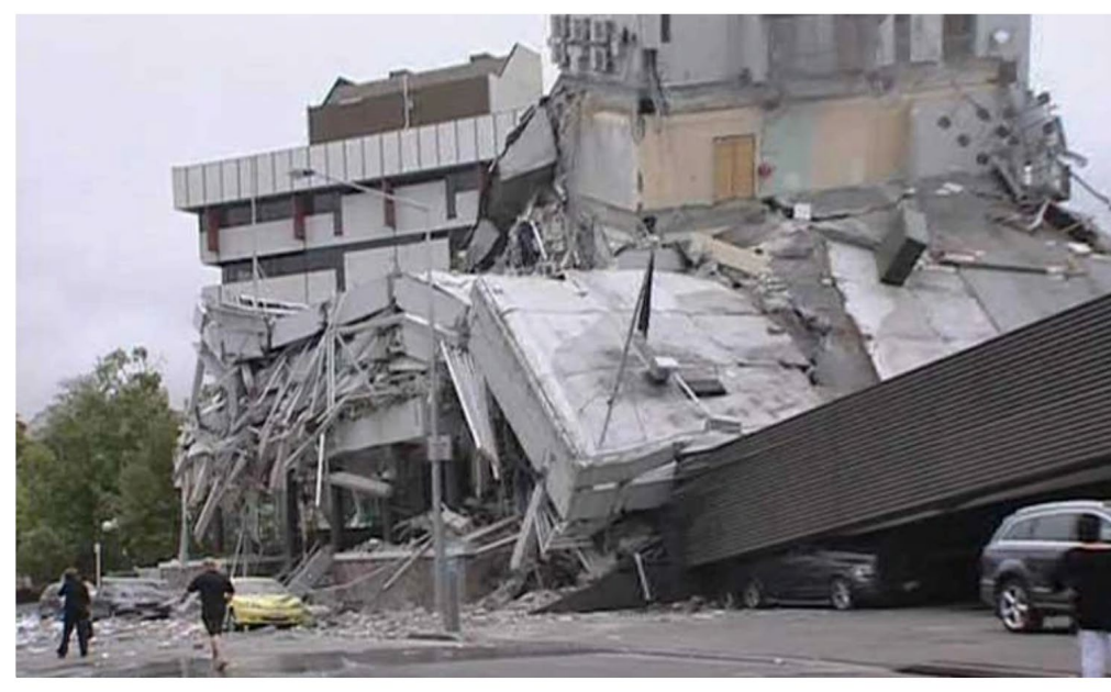
Damage to CTV building following Christchurch earthquake.