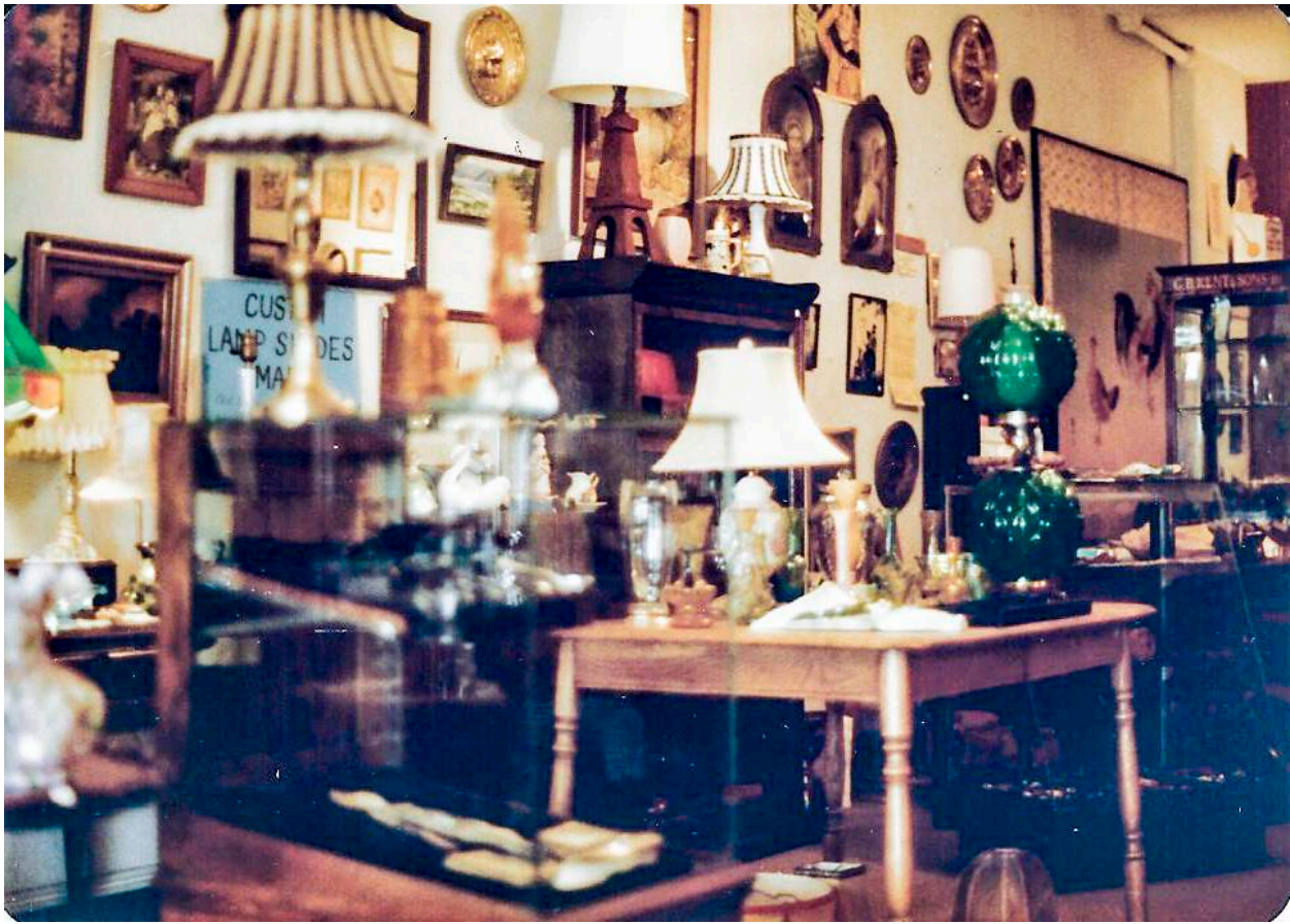
Gaslight and Shadows, 1976.