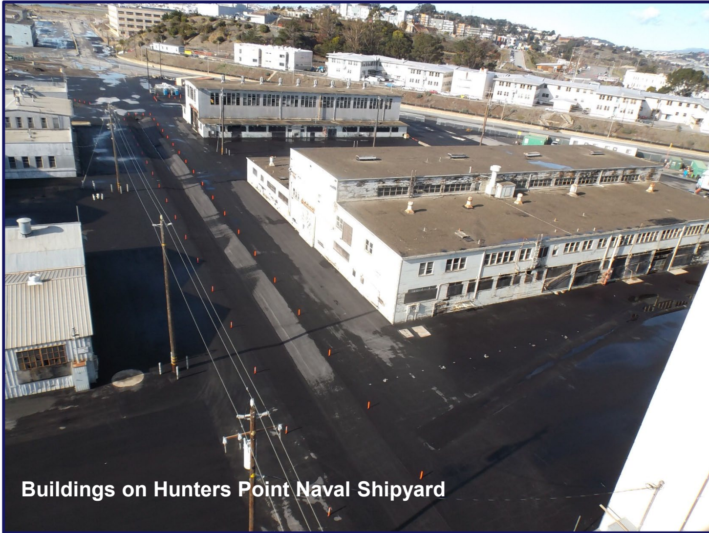
Buildings on Hunters Point Naval Shipyard