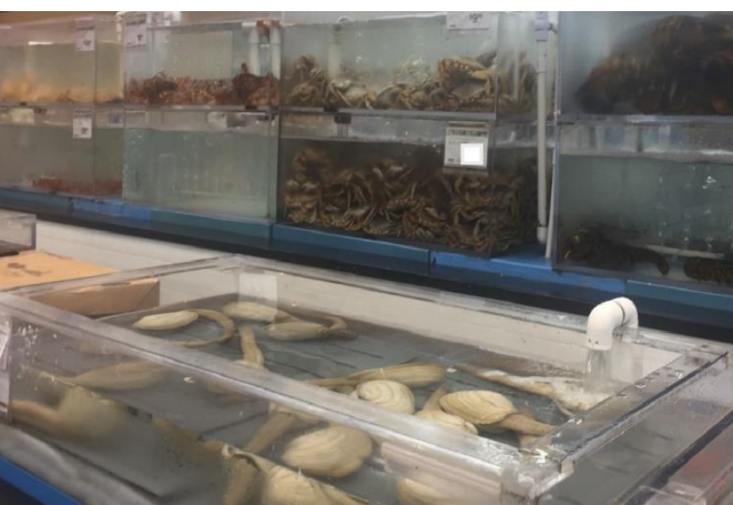
Live shellfish holding tanks