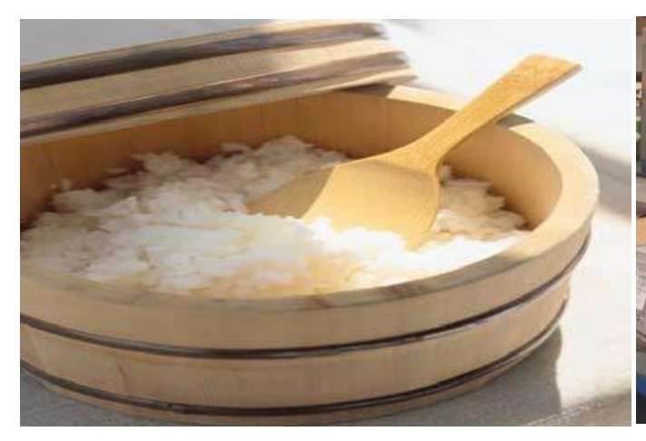
Use of additive, such as vinegar, to render sushi rice to not be potentially hazardous