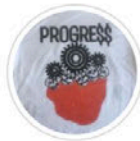
Shirts $20 ...