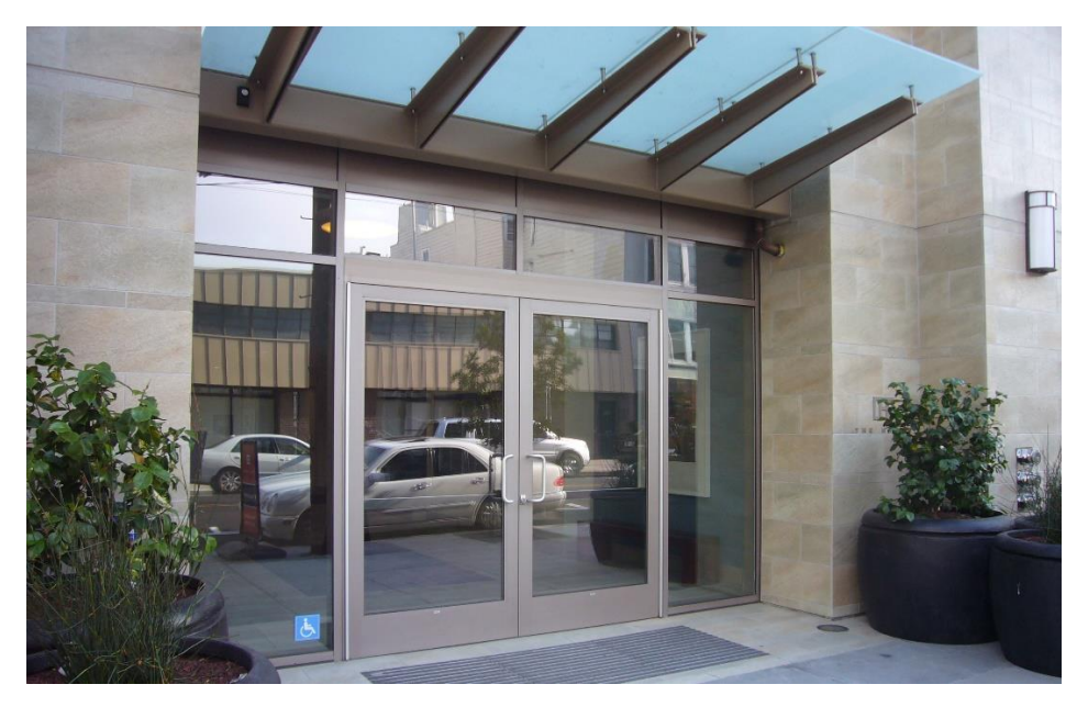
Glass ABOVE the outriggers