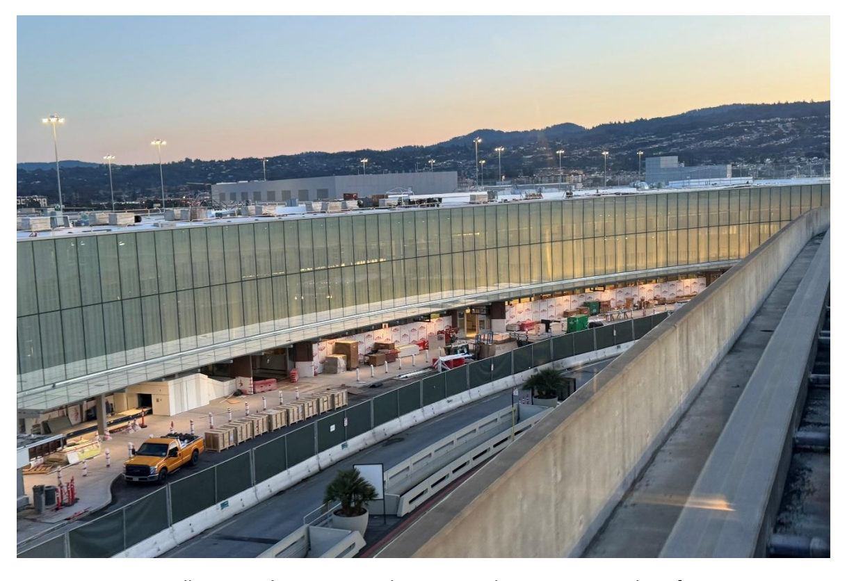
SFO Harvey Milk Terminal 1 - Canopy Glass ABOVE the outriggers - Clean from AirTrain