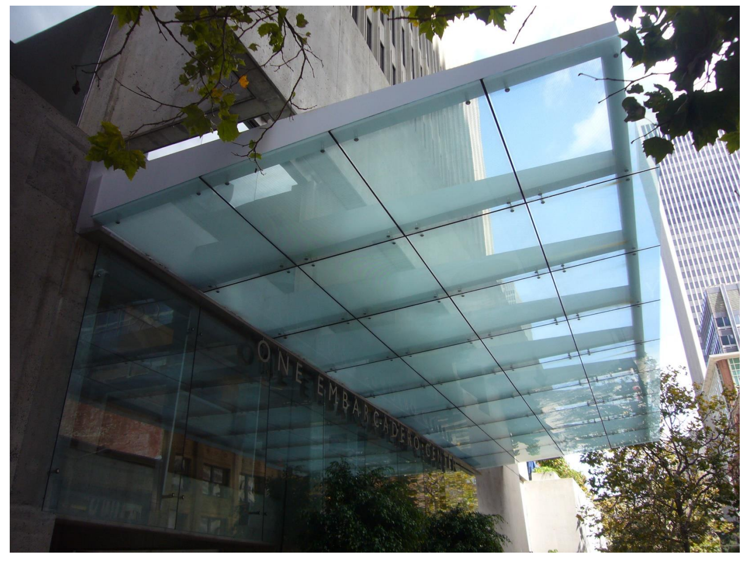
Glass hanging \ensuremath{\mathbf{BELOW}} the outriggers