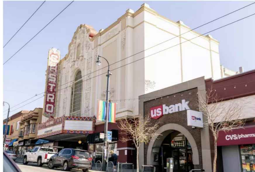
An exterior view of the historic Castro Theatre in the Castro district of San Francisco.