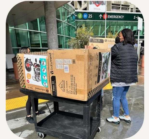
CHWs delivering car seats to L&D for families being discharged after birth