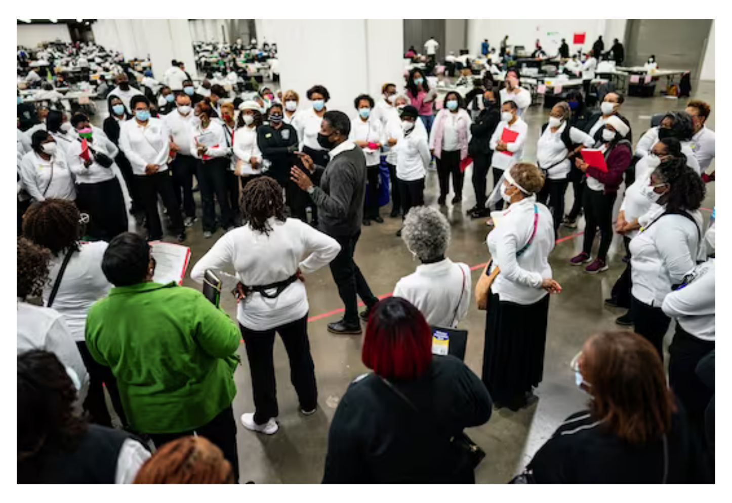
Poll workers gather for a meeting before counting ballots during the 2020 general election at the TFC Center in Detroit on Nov. 3, 2020.

In Colorado, the executive board of the county clerks association sent a letter to elected officials across the state begging them to vouch for the integrity of elections and stand against "dishonest actors, grifters, and bullies, who deserve only our disdain and contempt." The December letter provided talking points for officials to share when asked about the voting process and stated: "Now is the time for courage, not cowardice."