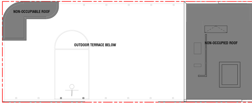
FLOOR PLAN - ROOF LEVEL 3 SCALE: 1/8" = 1'-0"