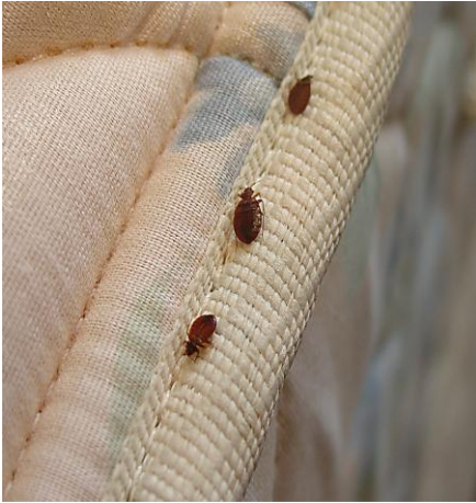
Bed Bugs Nesting in a Mattress