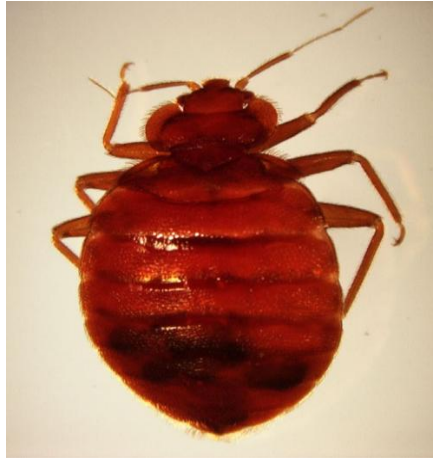
Adult Bed Bug