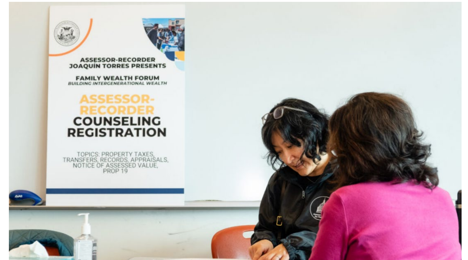
Photo: Assessor-Recorder staff helps a constituent during a one-on-one counseling session at the Assessor's 2023 Family Wealth Forum.