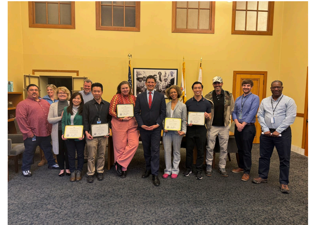
Photo: January 2024 Employee Recognition Ceremony