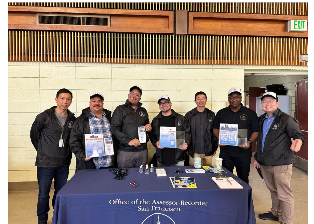
Photo: February 2024 City & County of San Francisco Job Fair