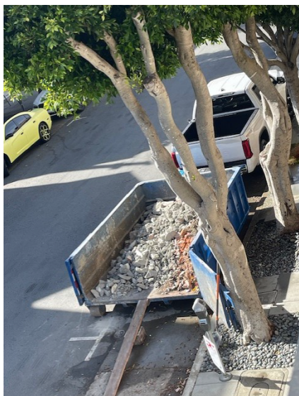
Photo of the stair debris in the dumpster on November 1, 2023. Again, this is over month the permit # 202108025569 was approved on December 4, 2023.