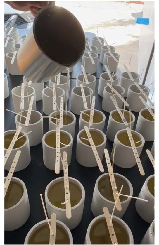
Creating oil & scent blends which are poured into the candle vessels.