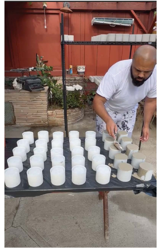
Hand crafting each candle vessel.