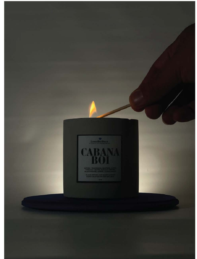
Craft in its final stage and presentation.