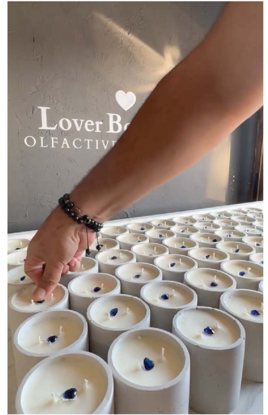
Each candle cures for 5 weeks and each candle receives a signature blue crystalline heart.