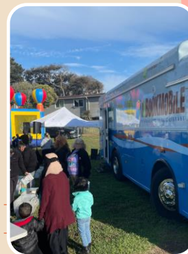
National Night Out