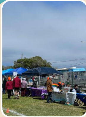
Pacific Islander Health Fest

total visitor count: 308 free book giveaway: 450