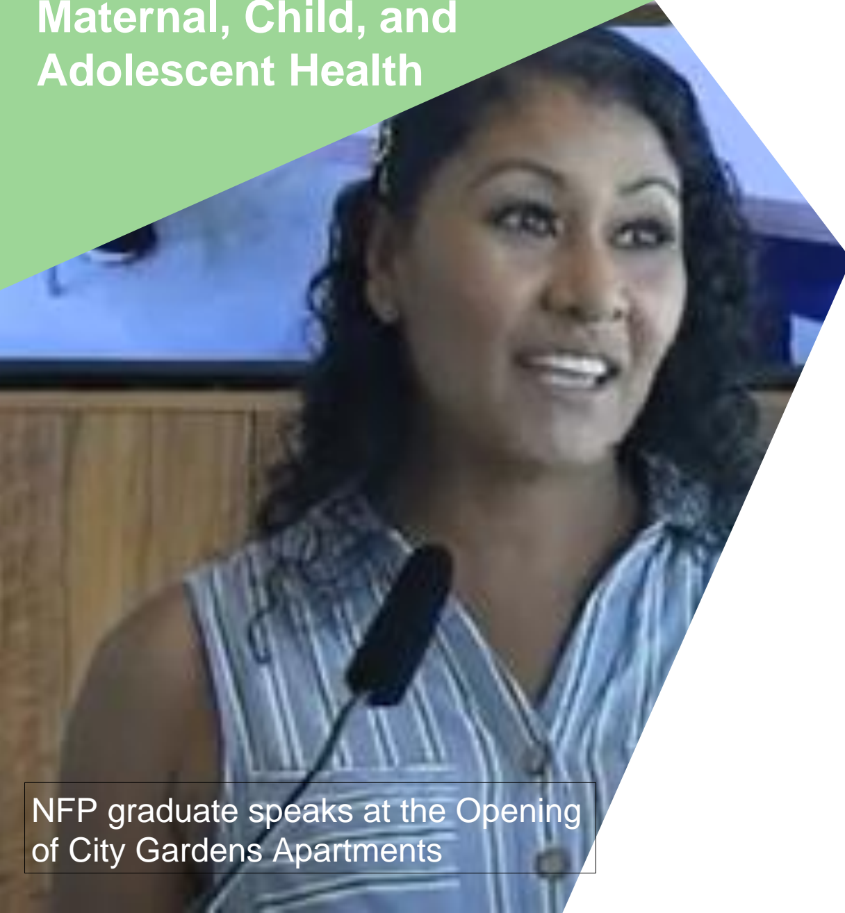
NFP graduate speaks at the Opening of City Gardens Apartments