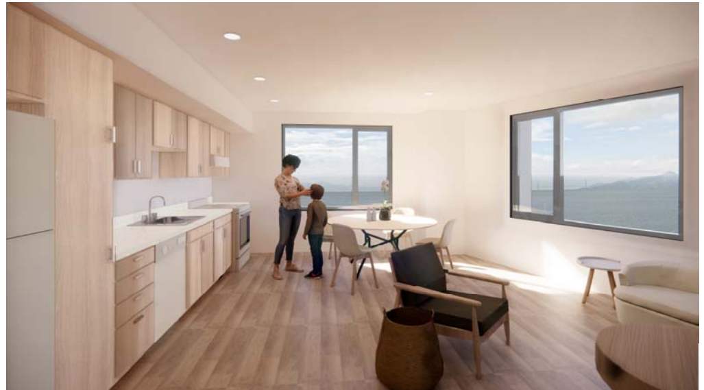
Rendering of unit kitchen and dining area