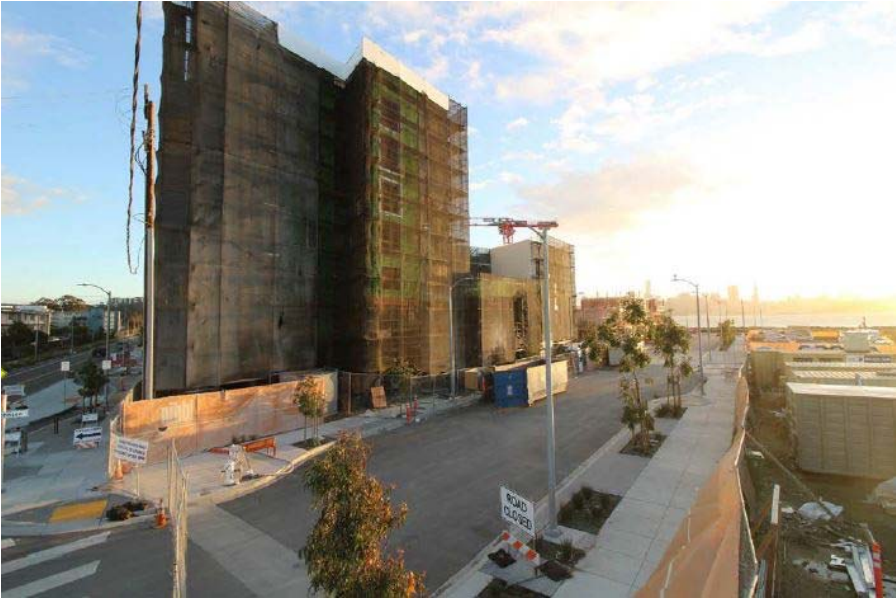
View along Johnson Street