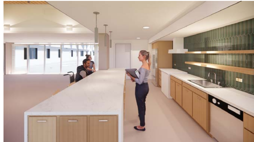
Community room kitchen