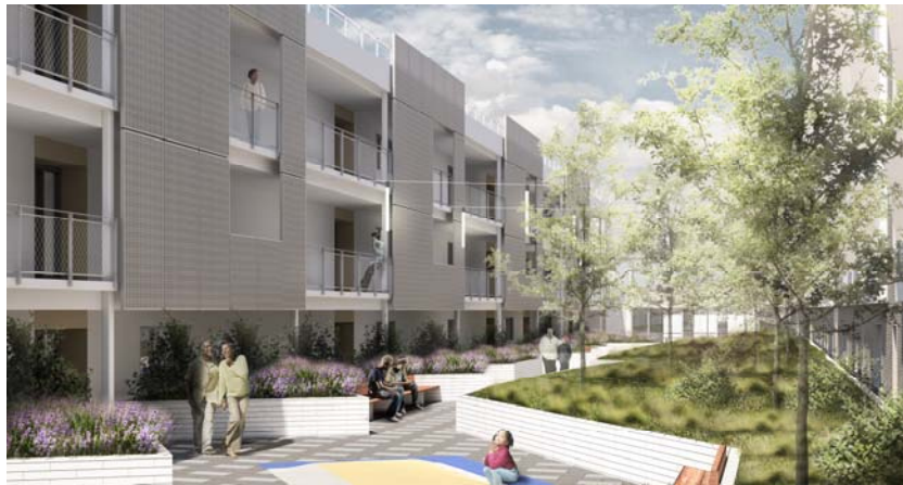
Courtyard facing North