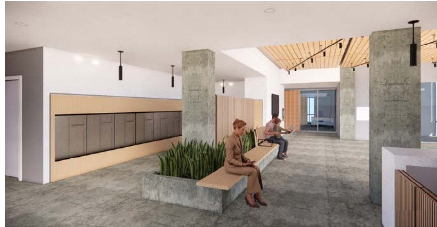
Entry lobby and mail area