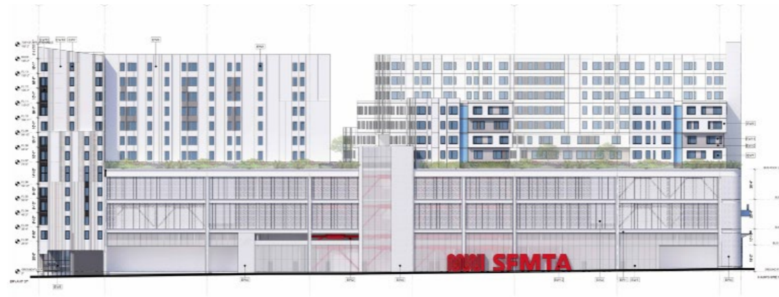
2500 Mariposa Street south elevation with the SFMTA signage in view, illustration by IBI Group