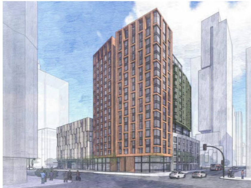
Transbay Block 2 East Family Building, rendering by Kennerly Architecture & Planning