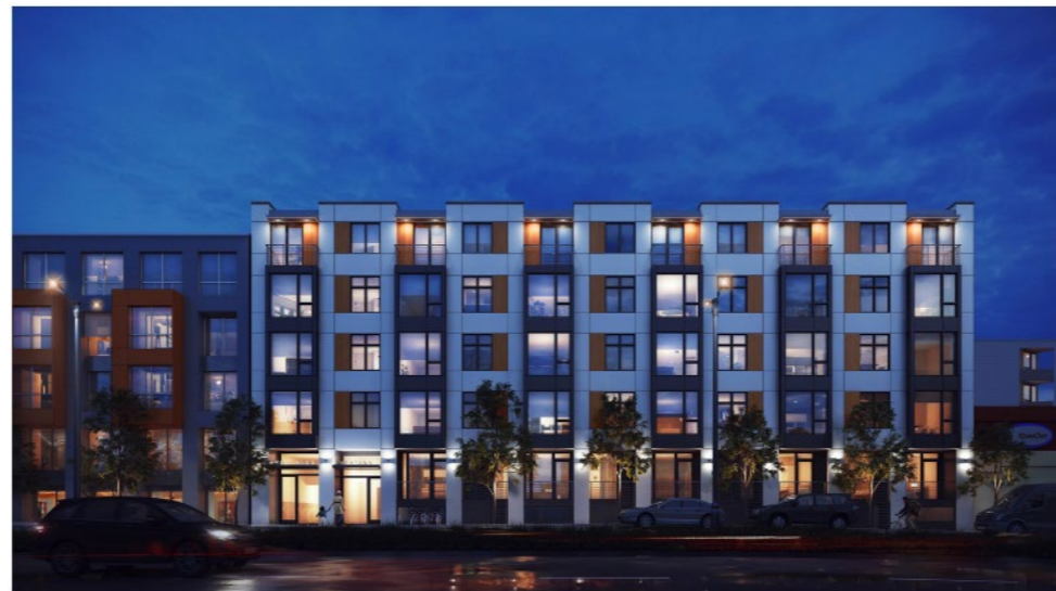
65 Ocean Avenue design, rendering by rg architecture