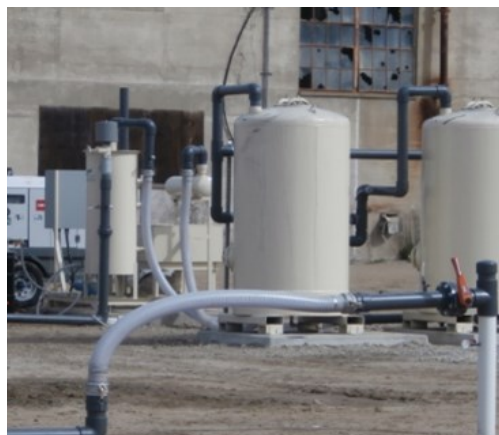
An extraction system removed vapors from the soil