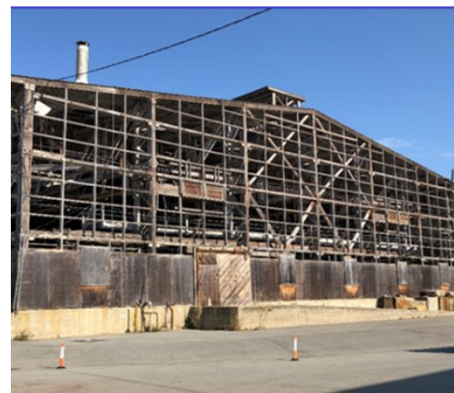
Demolition of Building 123 allows access to remove contaminants from underlying soil