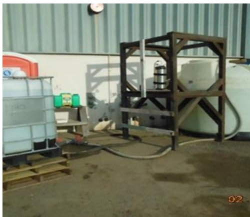
Environmentally-friendly bacteria was used to treat groundwater at IR-10