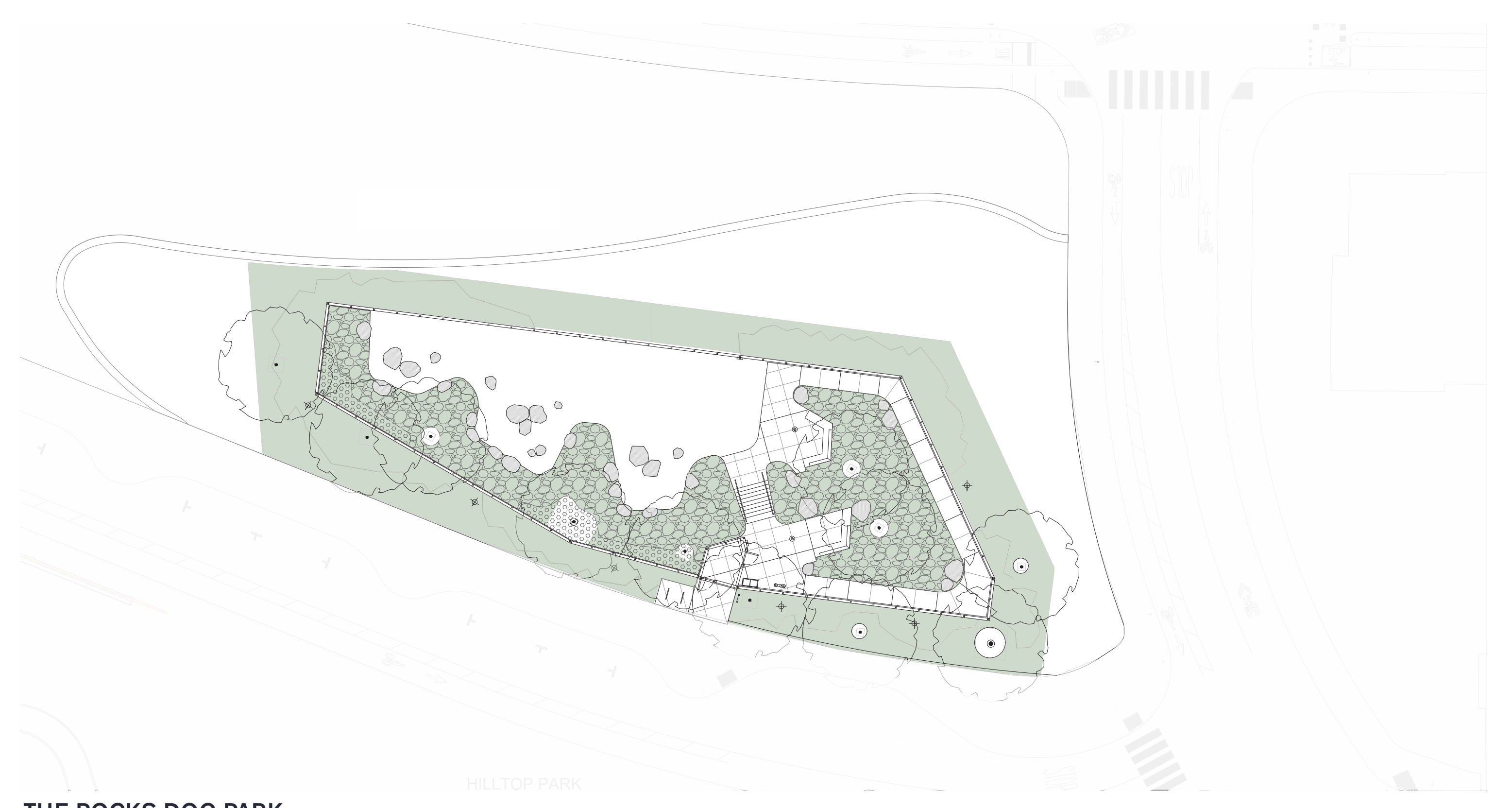
THE ROCKS DOG PARK SITE OVERVIEW