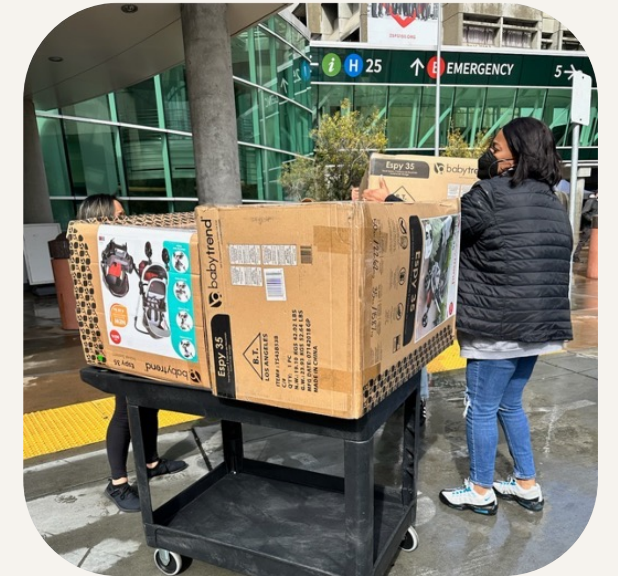
CHWs delivering car seats to L&D for families being discharged after birth