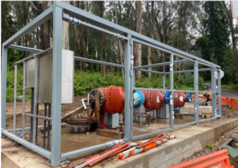
Clarendon Supply Site