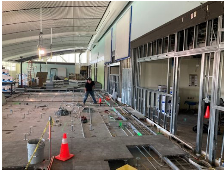
911 Call Center construction at the City's Emergency Operations Center