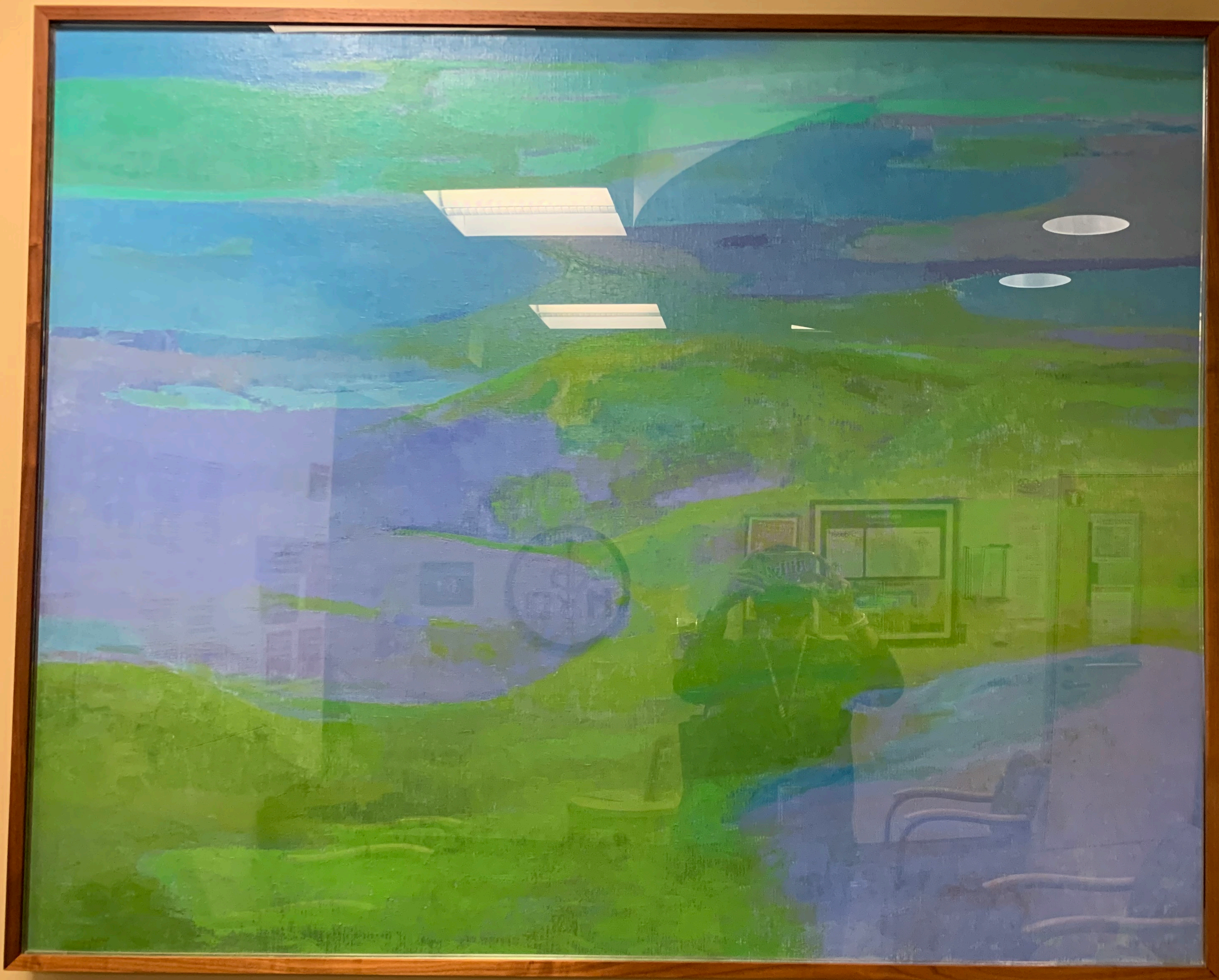
SF MHC RICHARD MAYHEW AMERICAN, b. 1924 SENECA 1962 OIL ON CANVAS RICHARD MAYHEW IS KNOWN FOR HIS EXPRESSIVE LANDSCAPES CHARACTERIZED BY HIS MASTERY OF LIGHT AND COLOR. HIS USE OF CLOSE COLOR TONALITIES AND SUBTLE SHIFTS OF HUE AND VALUE RESULT IN MYSTICAL LANDSCAPES THAT OFTEN FLOW INTO ABSTRACTS. MAYHEW SAID, "I PAINT THE ESSENCE OF NATURE, ALWAYS SEEKING THE UNUSUAL SPIRITUAL MOOD OF THE LANDSCAPE." HE SAID HIS APPRECIATION FOR LAND COMES FROM HIS AFRICAN AND NATIVE AMERICAN HERITAGE. "IT'S A DUAL COMMITMENT TO NATURE. THE LAND IS VERY IMPORTANT TO BOTH CULTURES IN TERMS OF STIMULATION AND SPIRITUAL SENSITIVITY, AND IT'S VERY IMPORTANT TO ME." COLLECTION OF THE CITY AND COUNTY OF SAN FRANCISCO COMMISSIONED BY THE SAN FRANCISCO ARTS COMMISSION AND AIRPORT COMMISSION FOR SAN FRANCISCO INTERNATIONAL AIRPORT