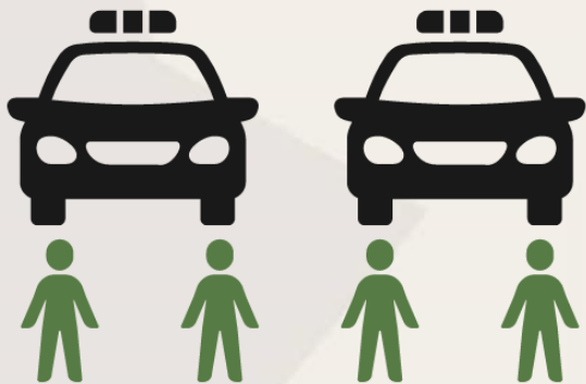
2 Field Training Cars with trainees (4 Staff members)