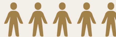
Warrant Services Unit (up to 5 Staff members)