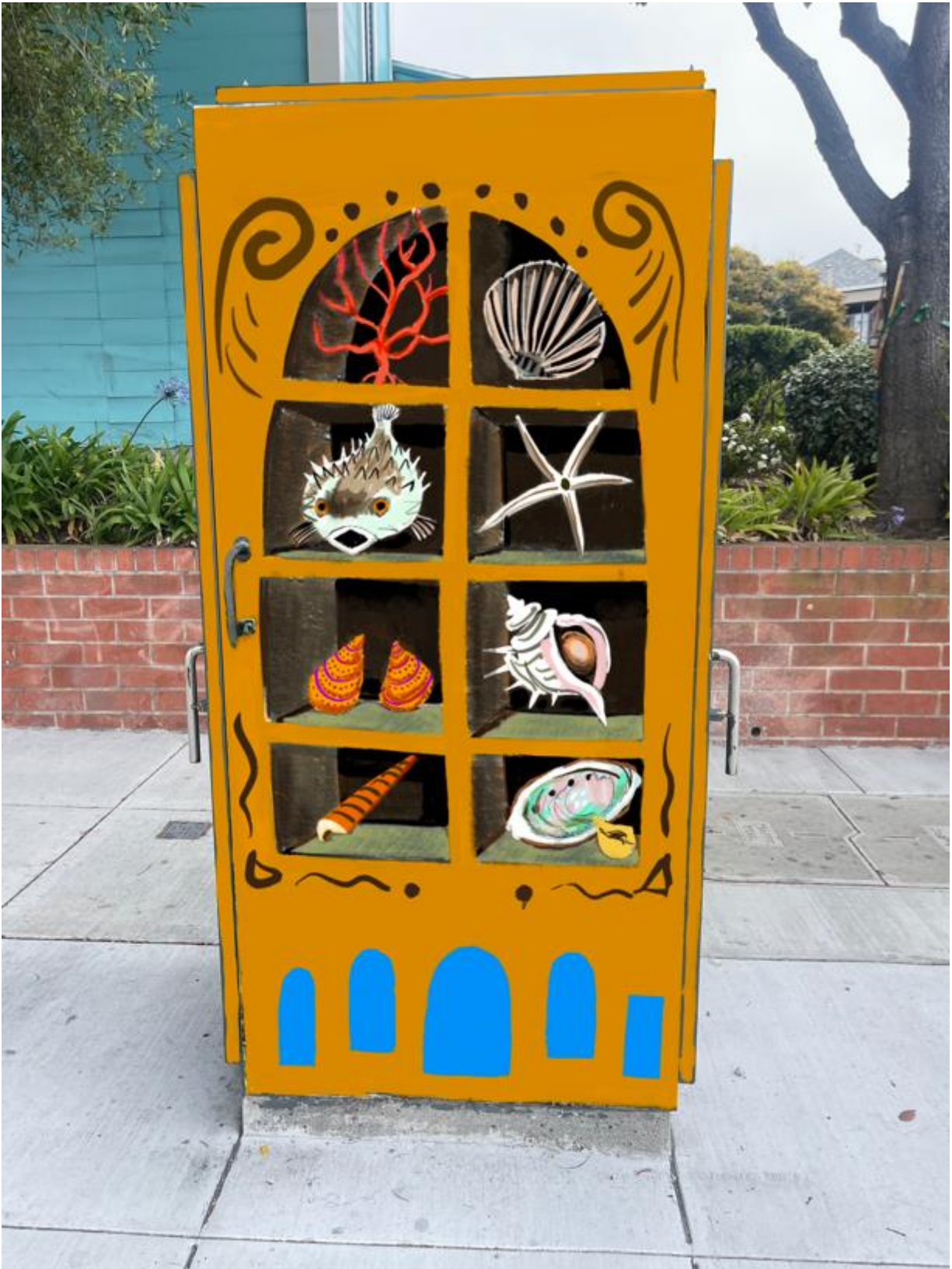
Attachment 8: Color image(s) of design "Cabinet of Curiosity" – Painted to Wrap Box as 3D Cabinet