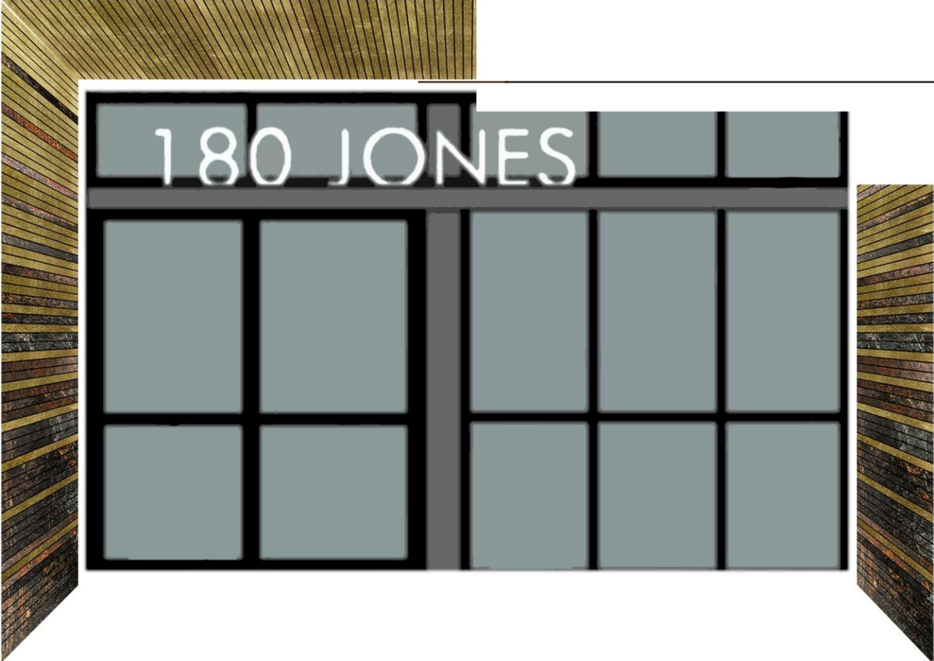
Tile layout design on the walls and ceiling of the main entryway using Ann Sacks "Elenco" series porcelain gold and nero tiles cut to 2" strips.