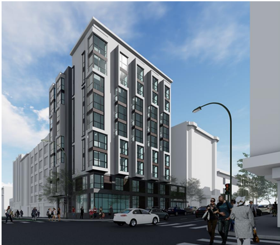
180 Jones Street

Tenderloin Neighborhood Development Corporation (TNDC) of San Francisco requested a selected group of artists residing in the Bay Area to submit their qualifications for the commissioning of an artwork for a new affordable housing project of 70 units located in the heart of the Tenderloin neighborhood of San Francisco on the southeast corner of Jones Street and Turk Street. The project will be a nine-story building spanning an area of 38,500 square feet. In addition to an on-site manager unit and the 35 subsidized units for adults exiting homelessness, 34 units will serve low-income residents making between 25% and 65% of the area's median income.