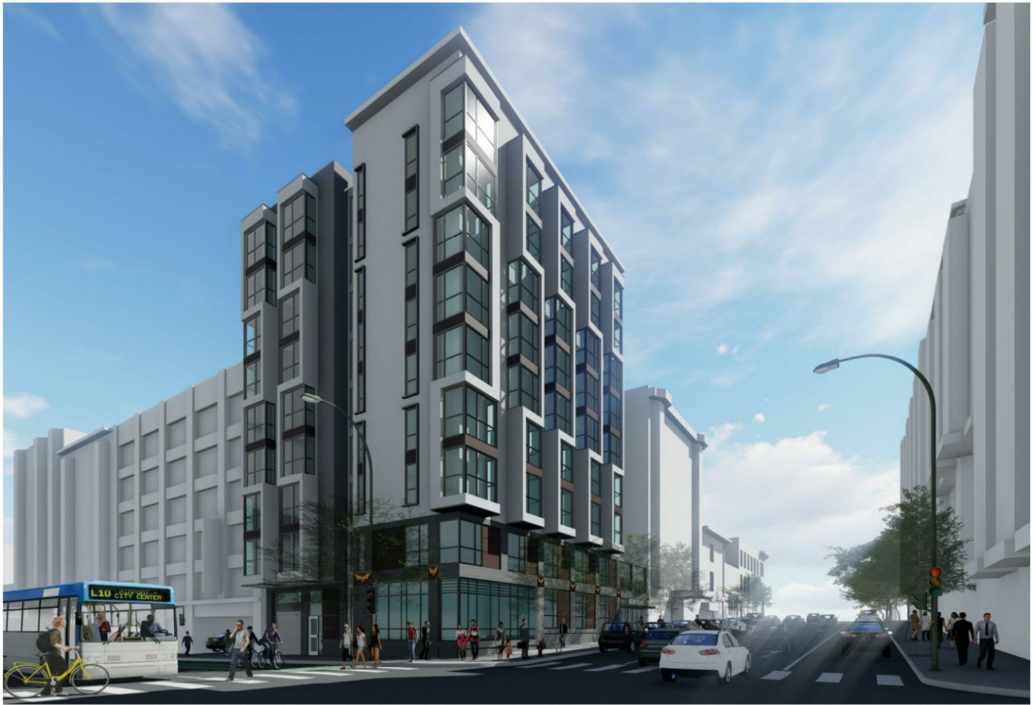
The medallions will reference the medallions of other older buildings, but will be new and modern.