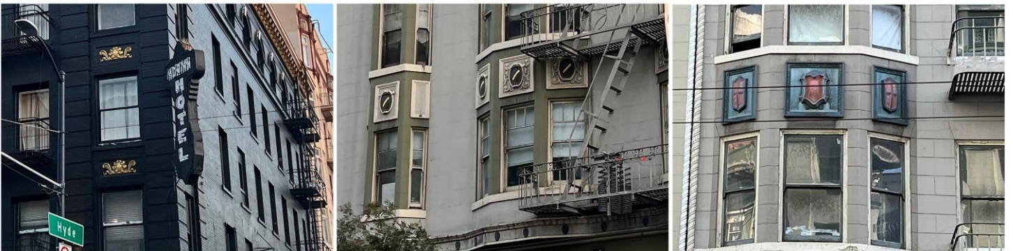
Examples of other buildings in the Tenderloin.