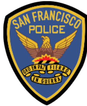
Darwin Naval Sergeant