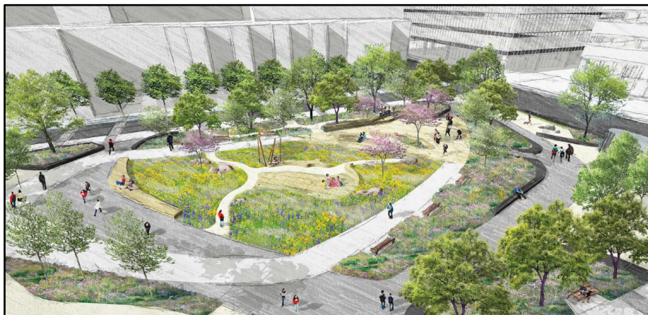
TB Block 3 Park