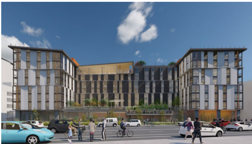
Mission Bay Block 9A