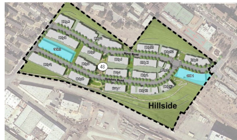
HPS Block 48