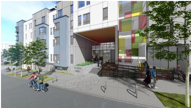
HPS Block 56