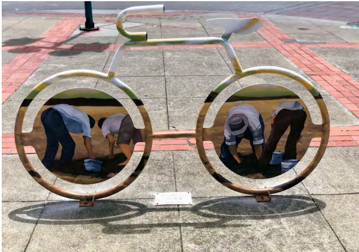
“La cosecha de la esperanza - The Harvest of Hope”, enamel, 18 sq ft. Location: Main St & Broadway St, Downtown Redwood City. Budget: $2000. Commissioned by the City of Redwood City. This bike rack mural honors the contributions of Latinx farmworkers in the Bay Area while providing additional bike parking for the increasing number of bikers in the city.