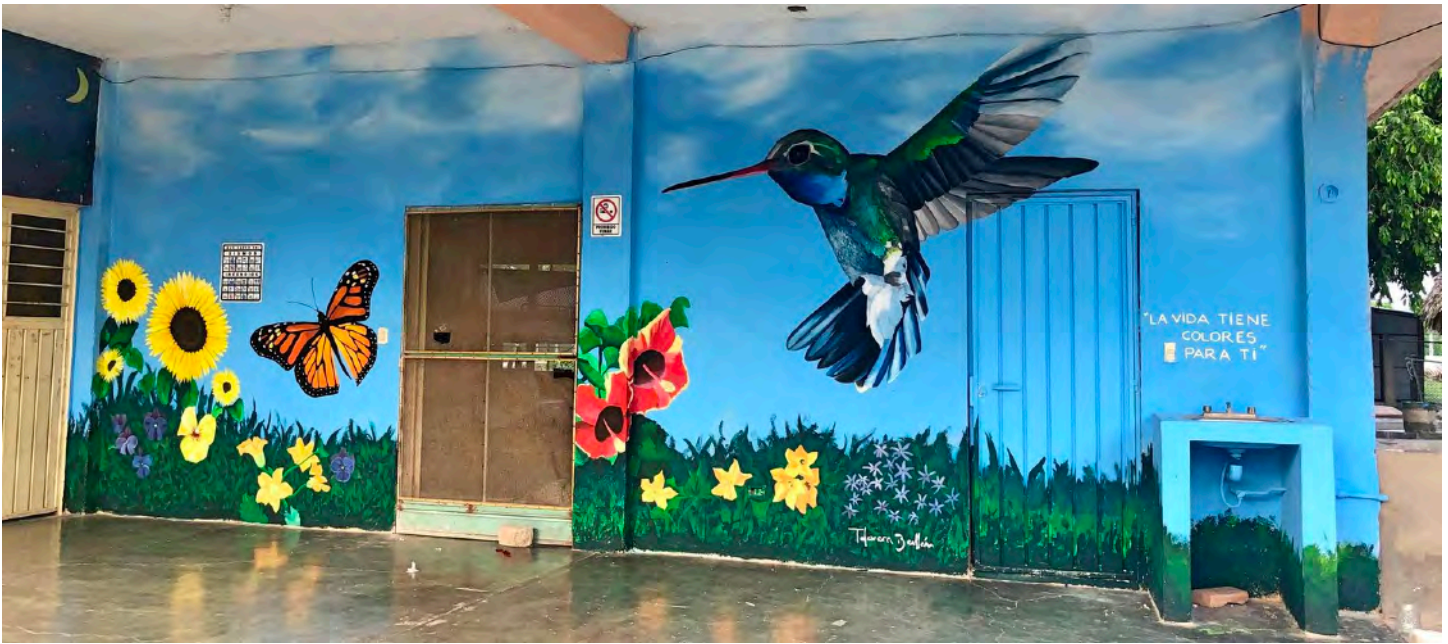
“La vida tiene colors para ti- Life Has Colors for You”, acrylic, 230 sq ft, 2019, Location: Hermanos en el camino, Migrant Shelter in Ixtepec,, Oaxaca, Mexico Budget: $ 5000 Community mural project created with input from the migrants staying at the shelter.