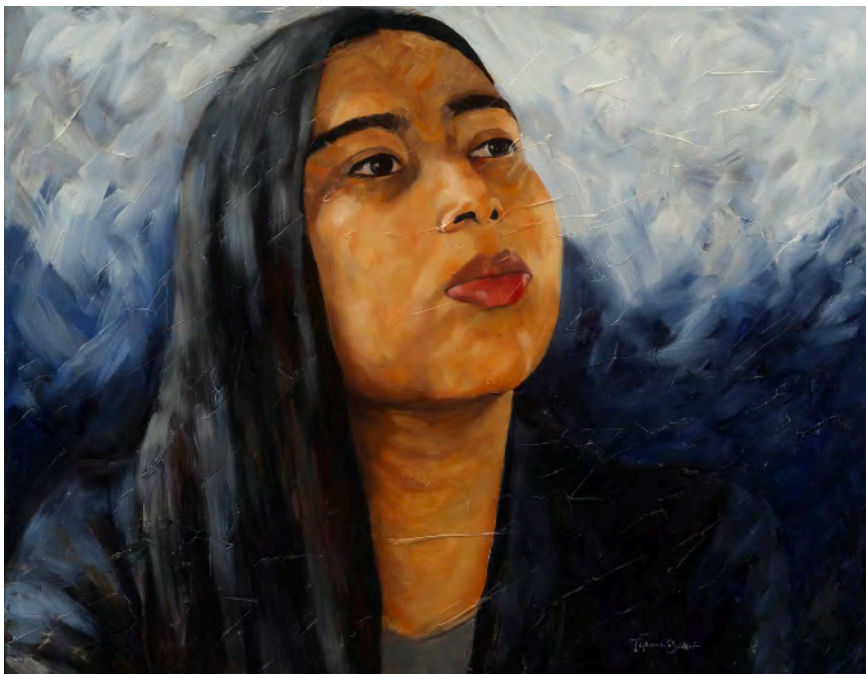
Kitzia la visionaria (Kitzia, The Visionary), Mujeres Luz Painting Series. Oil on canvas 41.5 x"32.5 "(2018) Part of the painting collection of the City of San Francisco (purchased in 2021)