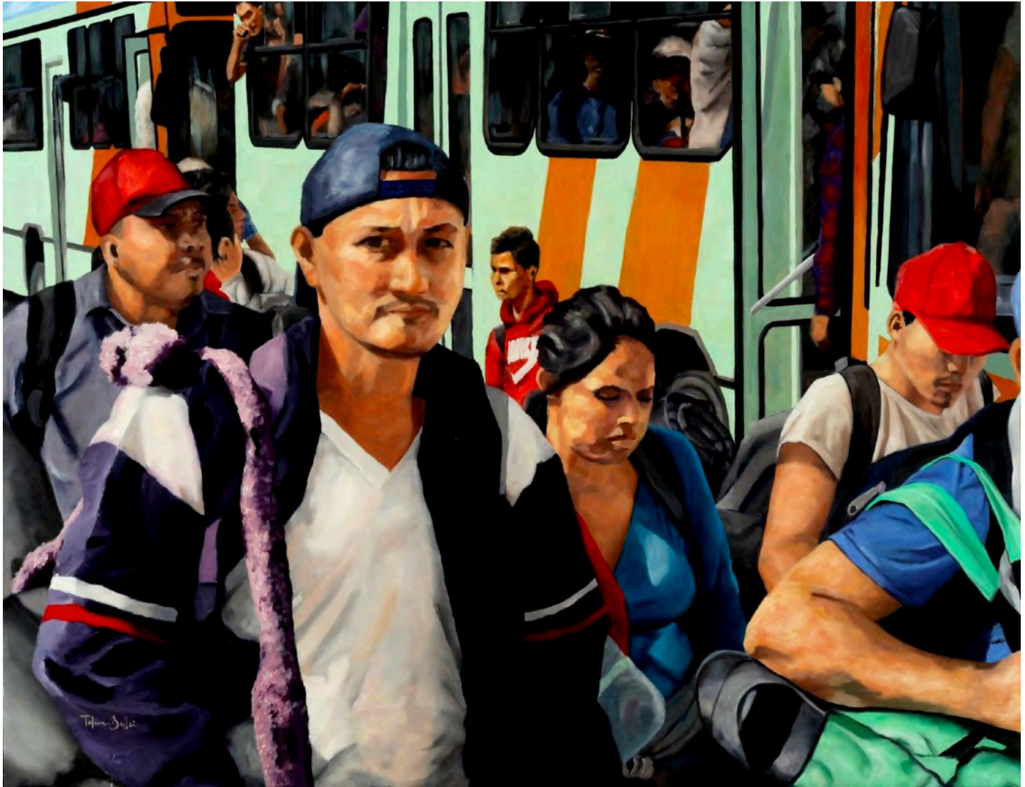
Sentimientos encontrados (Mixed feelings), Somos tierra que anda-Migran Caravan Painting Series. Oil on canvas 51"39.5 "(2018)