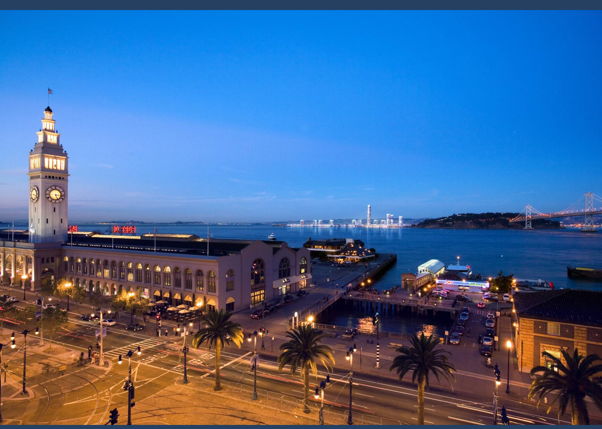
Treasure Island Development Authority