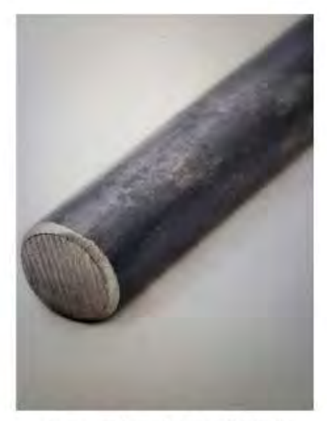
example of steel rods to be used to produce sculptures