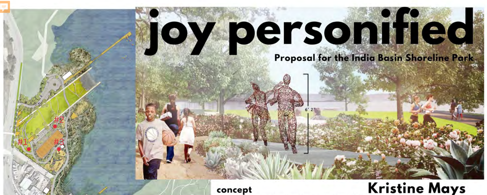
"Joy Personified" is a celebration of community.