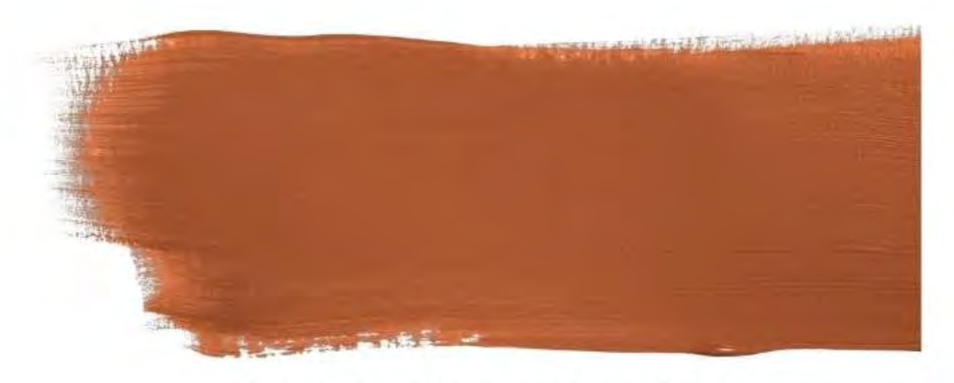
shiny copper color to be used on sculptures