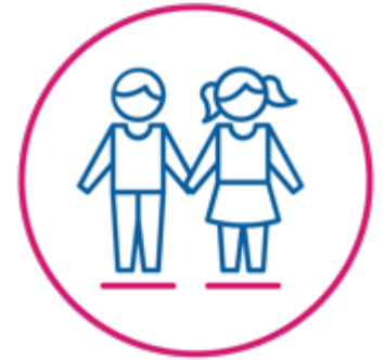
Child Support Debt