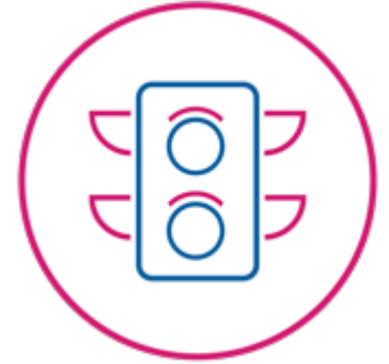
Traffic Court Tickets