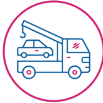
Towing and Booting Costs