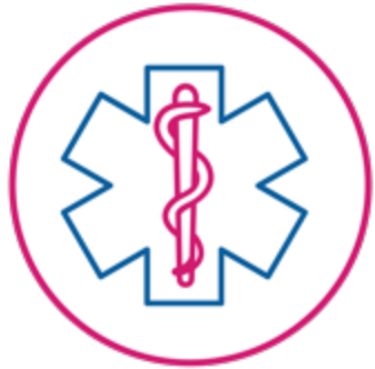
SFFD Emergency Medical Services