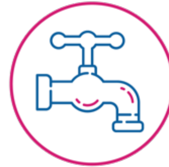
SFPUC Water & Sewer Bill