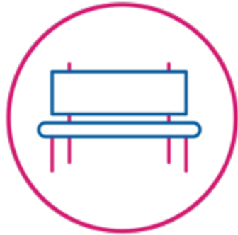
Quality of Life Citations