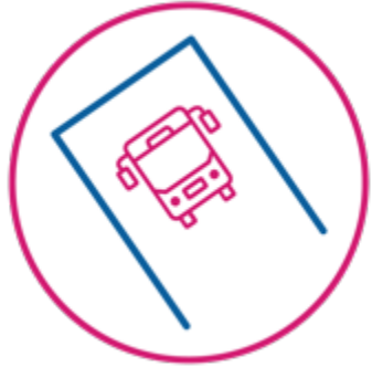
Fare Evasion Tickets