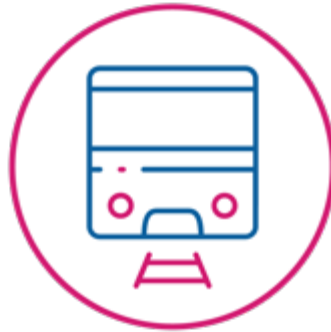
BART Proof Of Payment Tickets