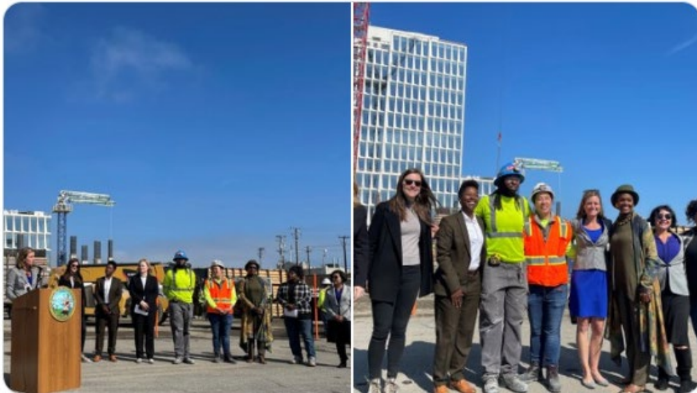
You and 9 others