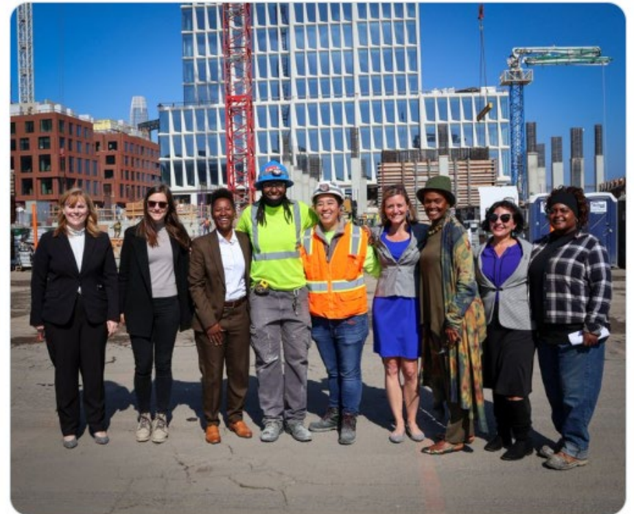
You and 6 others