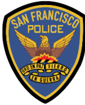
Darwin Naval Sergeant