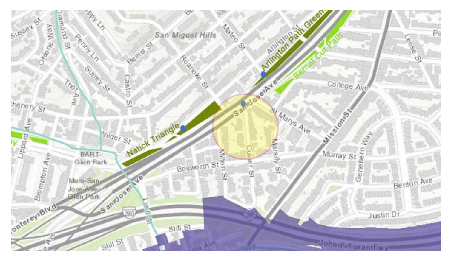
Cuvier is a 2 block street between Mission Street and Bosworth Ave. The proposed mural site is at the base of San Jose Ave along a retaining wall and pedestrian overpass.