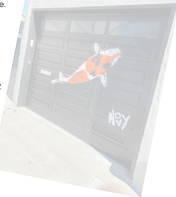
Owner of 1 Cuvier Street, San Francisco CA 94112