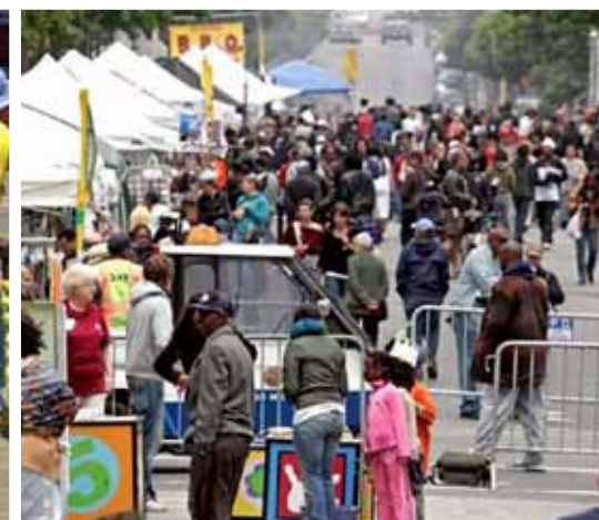
SAN FRANCISCO JUNETEENTH FESTIVAL