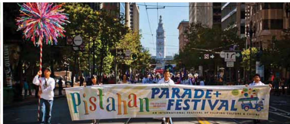
PISTAHAN PARADE AND FESTIVAL