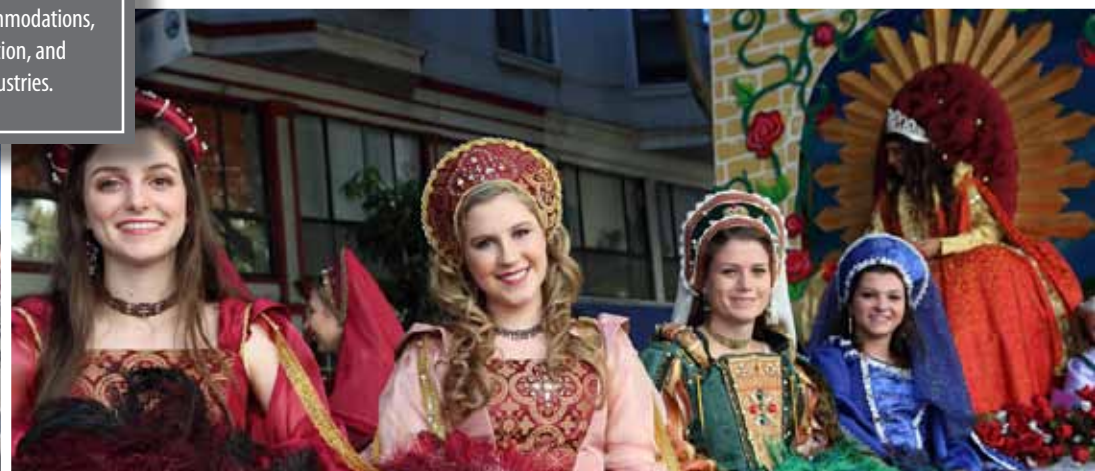
COLUMBUS DAY PARADE