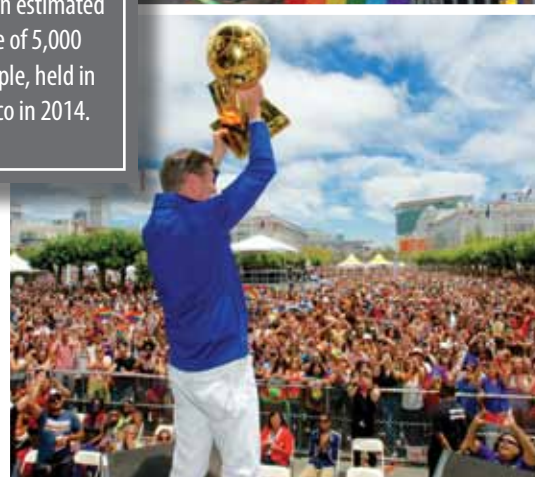
SAN FRANCISCO PRIDE