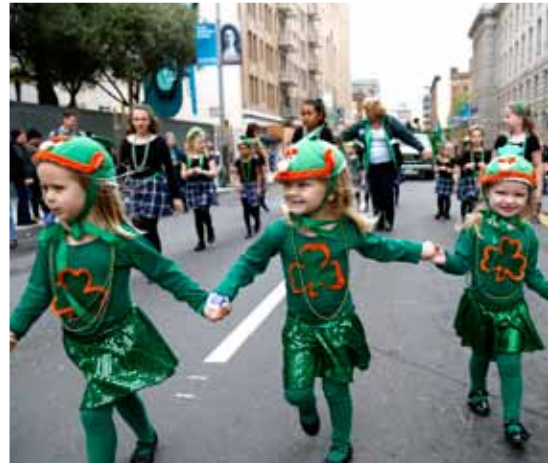
ST. PATRICK'S DAY PARADE AND FESTIVAL