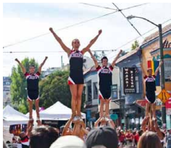
CASTRO STREET FAIR