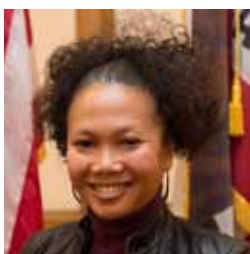
Theodora Caminong Commissioner Neighborhood Representative (current)