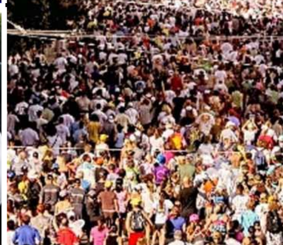
BAY TO BREAKERS