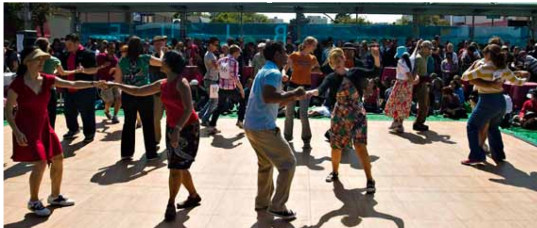
FILLMORE JAZZ FESTIVAL