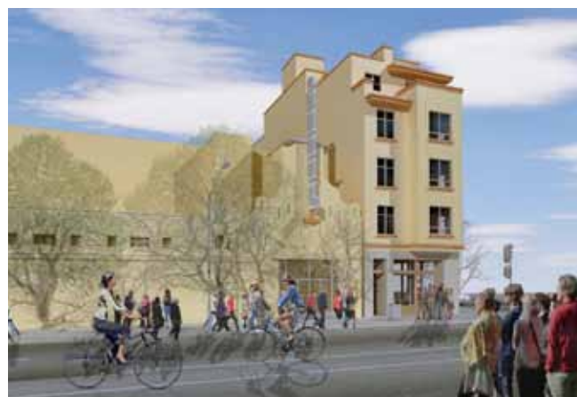
Above: A residential/commercial development with 8 dwelling units on 2799 24th Street, which is proposed to be built directly adjacent to the Brava Theater, an iconic theater space on the vibrant lower 24th Street Corridor in the Mission District.