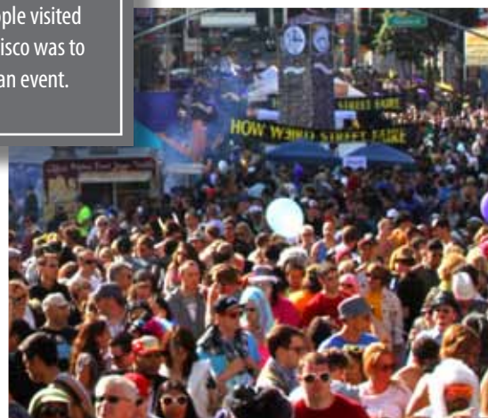
HOW WEIRD STREET FAIRE