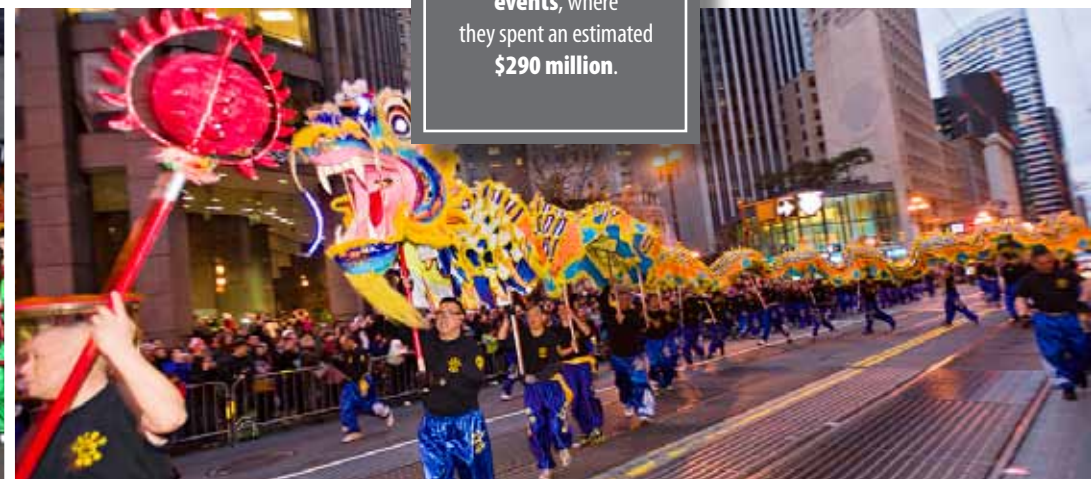
CHINESE NEW YEAR PARADE