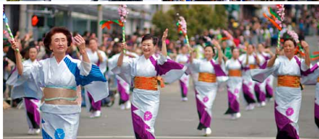
NORTHERN CALIFORNIA CHERRY BLOSSOM FESTIVAL