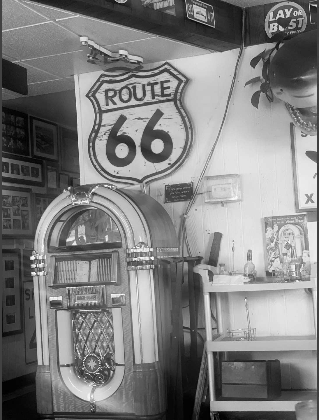
Miracle Hampton Night Market, 2021