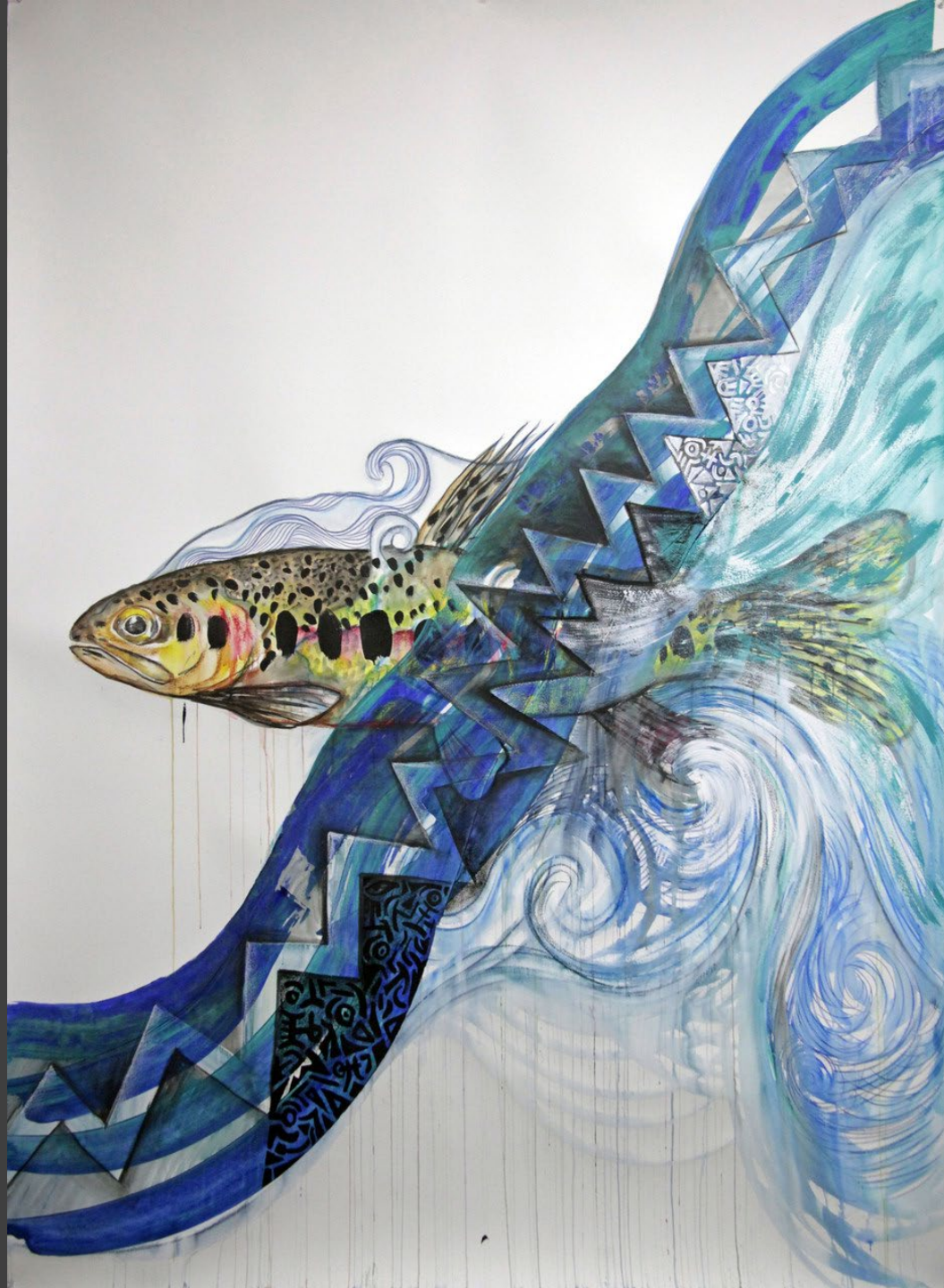
Adrian Arias Traveler (2022) 51" x 71" Mixed media on paper $4,000