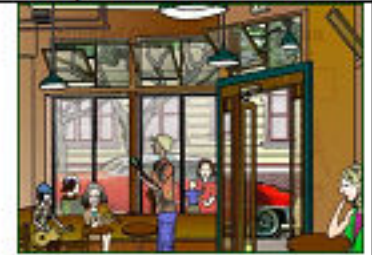
MD_CAB Concert at Bean There Café with Maestro Curtis' daughter's ensemble