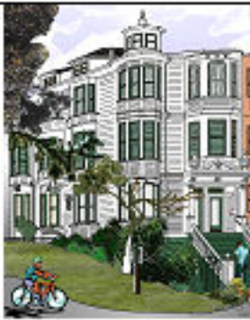
MD_GWH White and green house at Duboce park