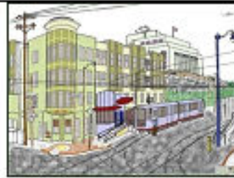
MD_NJL N & J Muni metro lines outbound