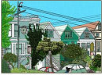
DP_SPS Duboce Park: steps @ Pierce street