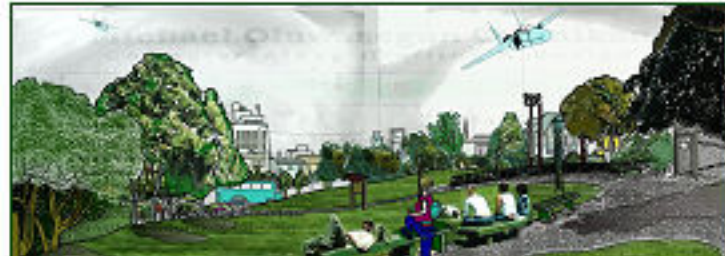
DP_HMC Duboce park from Harvey Milk Center