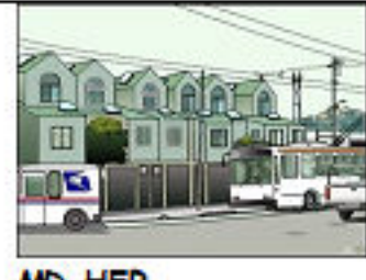
MD_HER Muni 22 Fillmore bus turning into Herman street