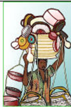
MD_PWW Street peddler of woven wares