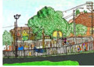
DP_OPA Duboce Park: children playground version 1