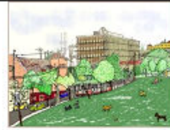
DP_DSC Looking at CPMC Davies campus from inside the park