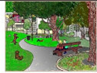
DP_DSD Looking at Harvey Milk Center from inside the park