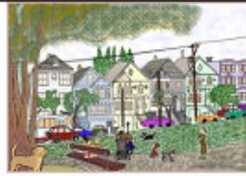
DP_DSB Looking at DuBoise street from inside the park 2 nd block