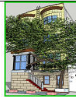
MD_HCL DuBoise Park House of Chinese lanterns