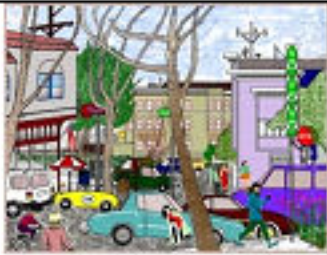
MD_DAS Looking at DuBoise park from Sanchez street