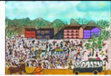
MD_LAM Life at the marketplace