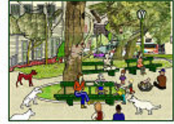
DP_ZOR Duboce Park: children listening to (3oflife) the storyteller @ Zora bench