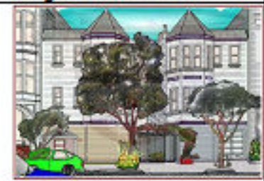
MD_WSH Waller street house