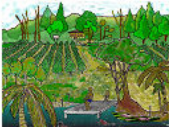
MD_MHS Mayflower High School River