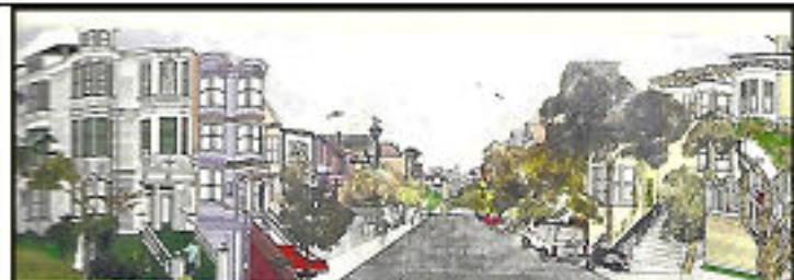
DP_POT Potomac street historic house