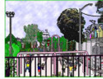
DP_CPB Duboce Park: children playground version 2