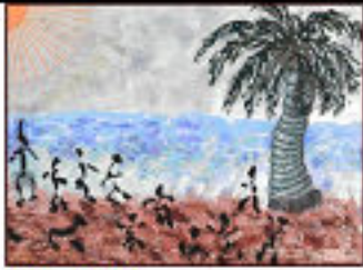
MD_RNB Restless natives at the beach praying and dancing