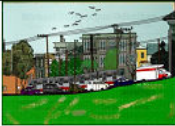
DP_DSA Looking at DuBoise street from inside the park 1 st block