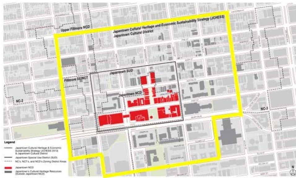
Map of Japantown showing the Japantown Special Use District, Japantown Neighborhood Commercial District, and JCHES/Japantown Cultural District.